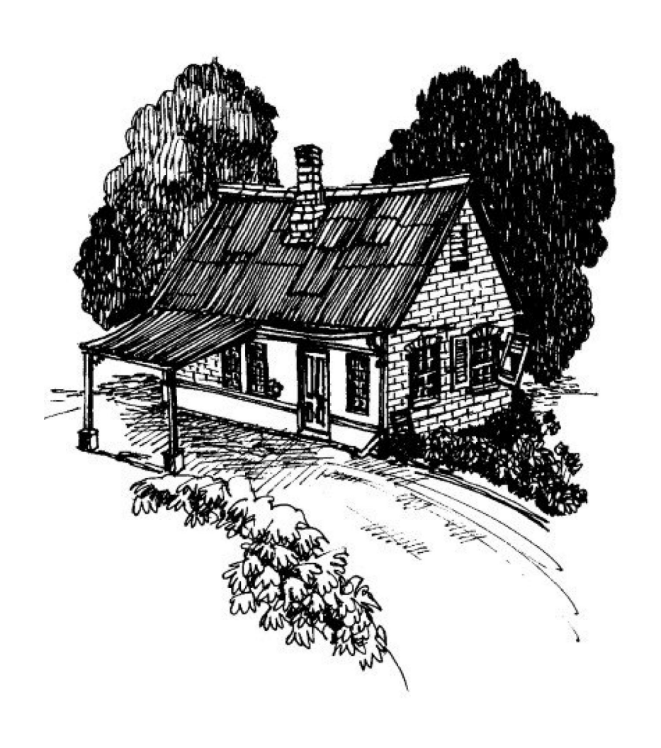
ई घर पुरान अछि। This house is old.