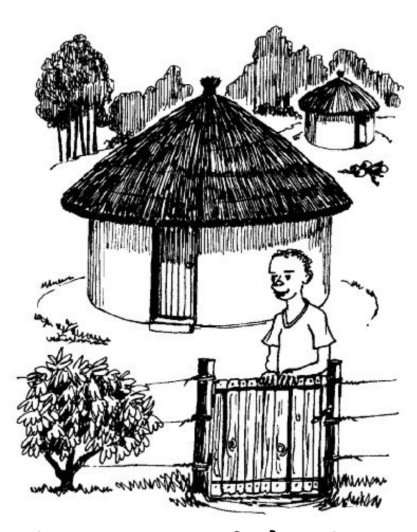
"जी" एकटा छारल घरमे रहैत अछि। Mzi lives in a thatched house.