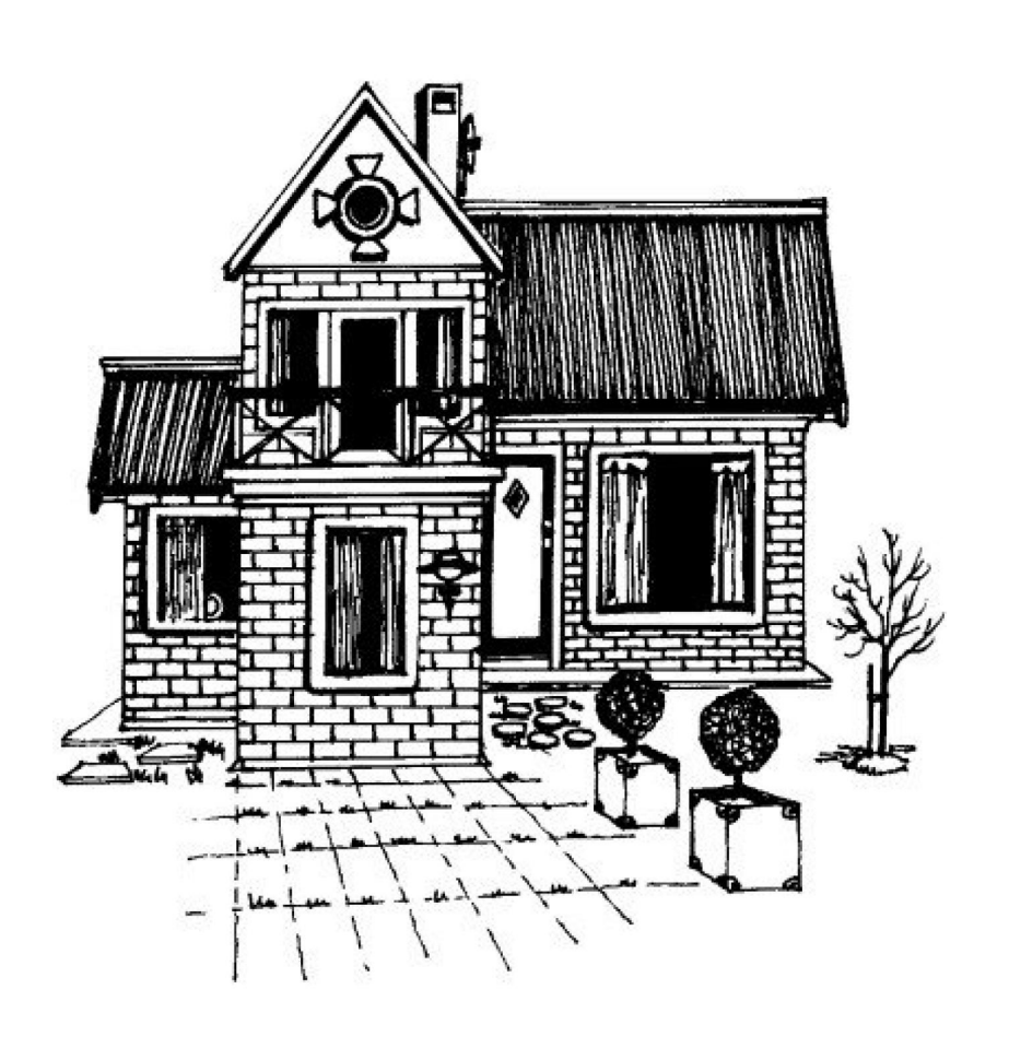
ई घर नव अछि। This house is new.