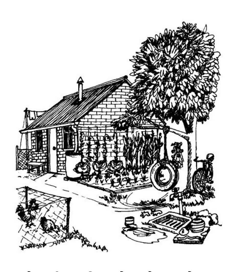
कतेक नीक लगितय ऐ घरमे रहबामे। I wish I lived in this house.